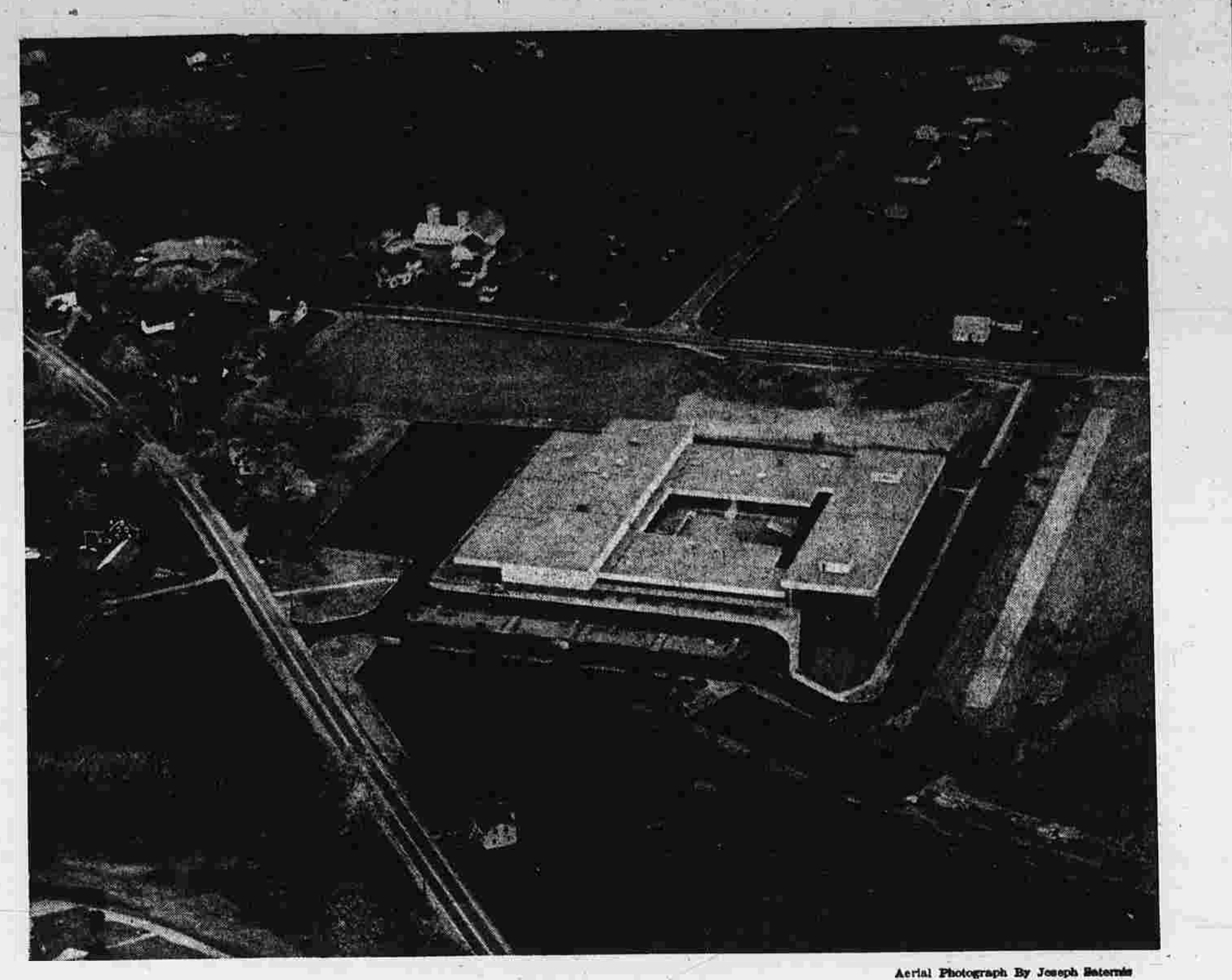
Aerial Photograph By Joseph Baccaro

self violated it. Cambodia can issue diplomatic protests, but it can't really frighten us. Laos is too divided and helpless to threaten anybody.