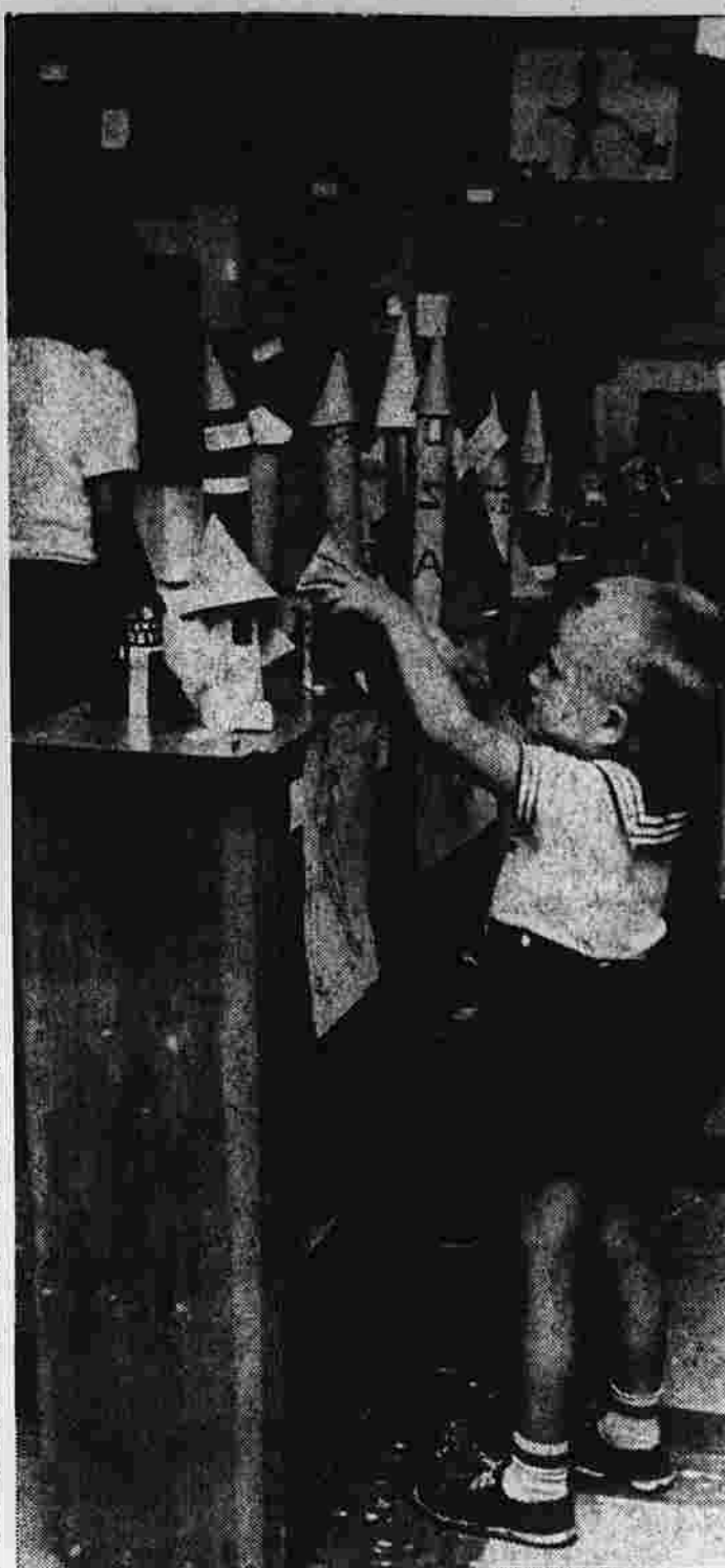
Picking His Spacecraft

Members usually come back to town from all over New England, as well as many other states. The day long get-together is held for old friends to meet again, to review old times and to further interest in the establishment of a museum or place to exhibit the many riches of Tolland's heritage.